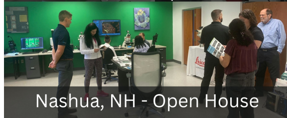
Nashua, NH - Open House