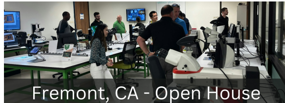
Fremont, CA - Open House